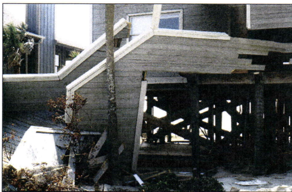
The rails on these stairs were enclosed with siding, presenting a greater obstacle to the flow of flood water and contributing to the flood damage shown here.