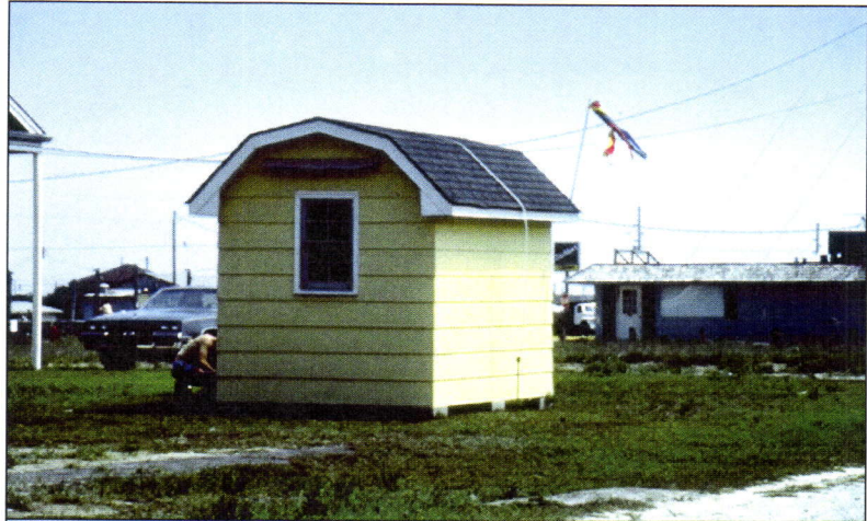
Small accessory building anchored to resist wind forces.