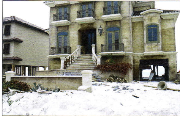
Large solid stairs such as these block flow under a building and are a violation of NFIP free-of-obstruction requirements.