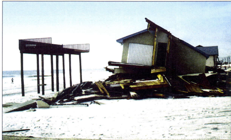
Damage from Hurricane Opal in Florida. This deck was designed to meet State of Florida Coastal Construction Control Line (CCCL) requirements. The house predated the CCCL and did not meet the requirements.

and/or wind forces. Decks should be given the same level of design and construction attention as the main building, and failure to do so could lead to severe building damage.