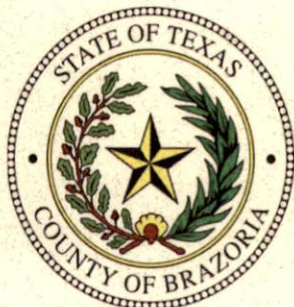
Commissioner, Precinct 3